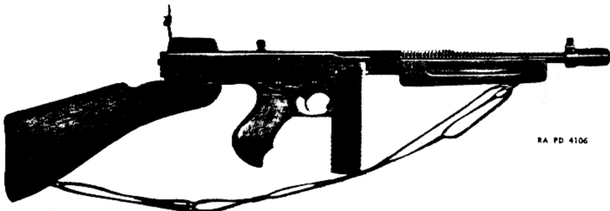
FIGURE 1.—Thompson submachine gun, cal. .45, M1928A1—right side view with 20-round magazine.